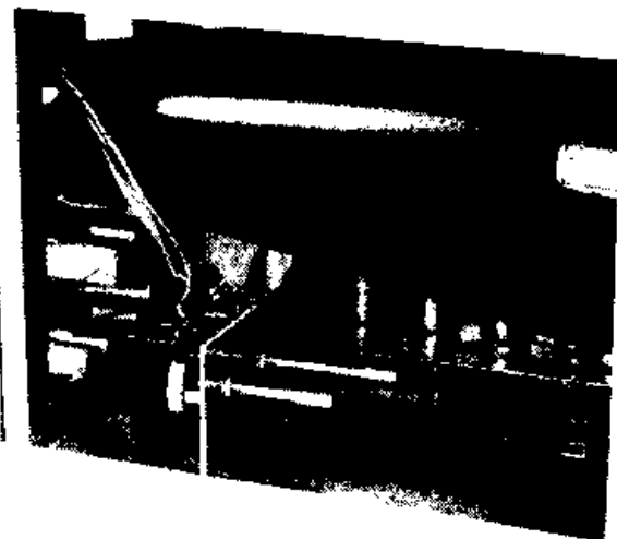
Also pictured is a side view of one of the Williams Tube modules.