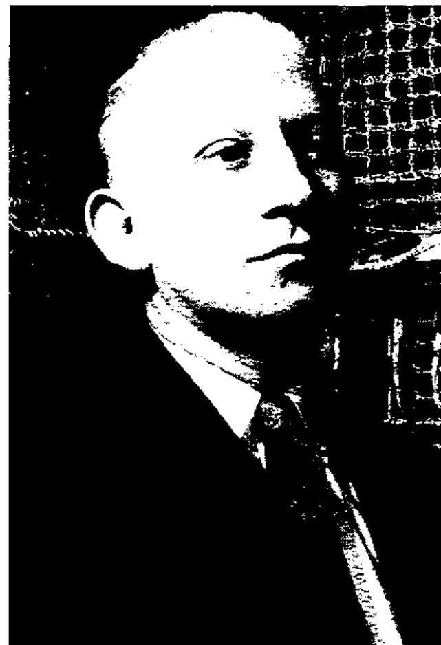
Dr. Alan J. Perlis