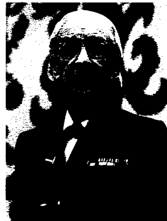
Grace Murray Hopper at the 1978 History of Programming Languages Conference.

After her retirement from the navy in 1986, Hopper joined the Digital Equipment Corporation as a senior consultant. Until the last few years, she was a very active public speaker, addressing a wide variety of audiences. □