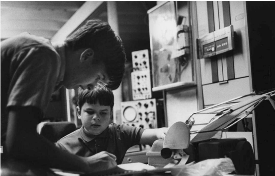
Two R.E.S.I.S.T.O.R.S. in the Computer Barn