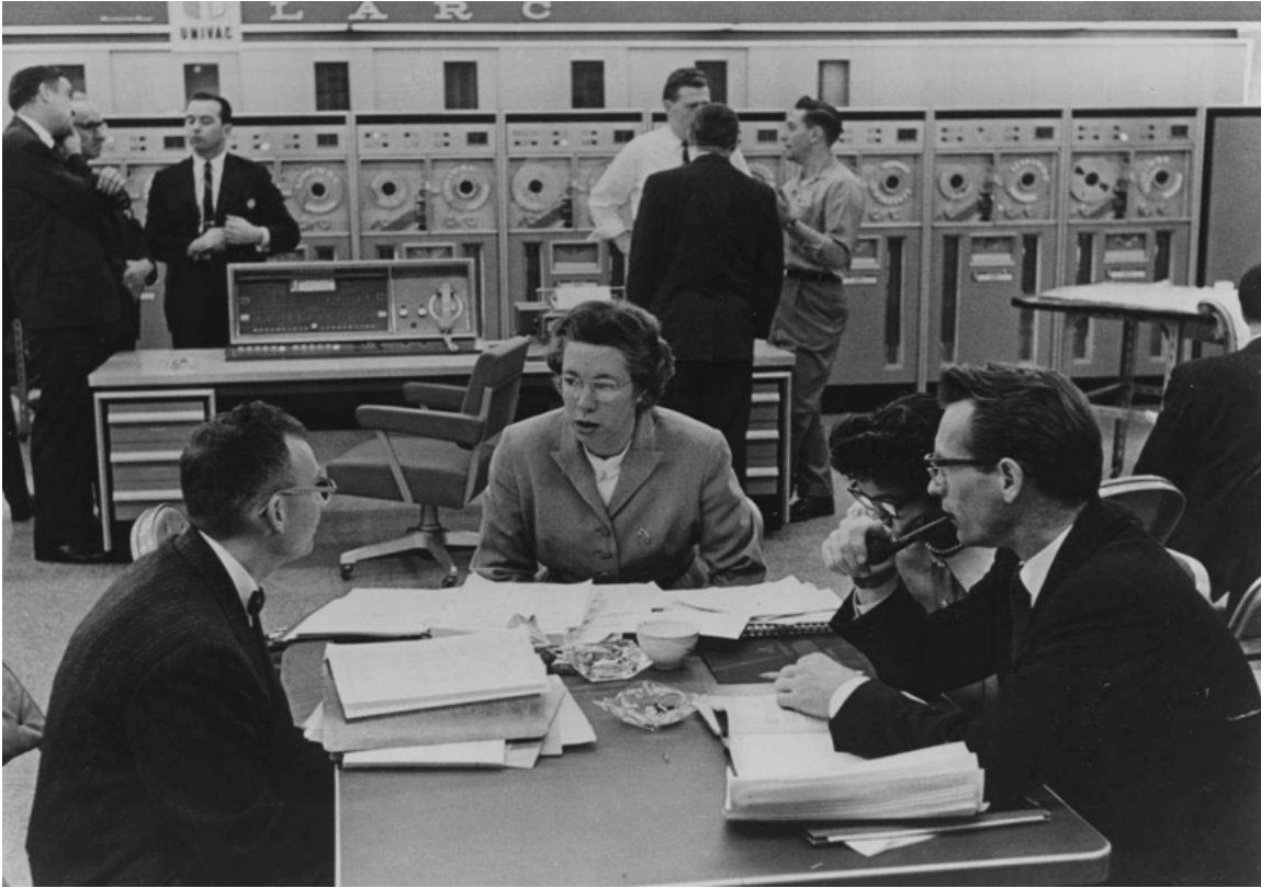
Frances “Betty” Holberton (Center) at David Taylor Model Basin