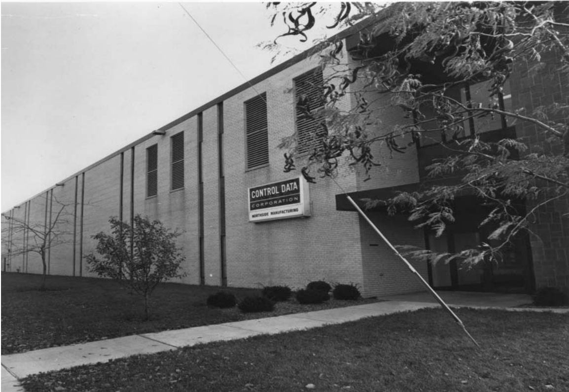
Northside Manufacturing Plant, 227 12 th Avenue North, Minneapolis